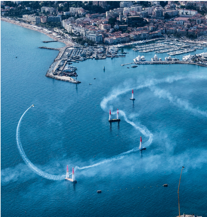
Francois Le Vot of France performs during qualifying day at the second round of the Red Bull Air Race World Championship in Cannes, France on April 21, 2018.

Pilots race one at a time and mere fractions of a second separate field, so it can be difficult for viewers to compare the performance of each pilot. With the help of its suppliers Red Bull Air Race invented a completely unique augmented reality (AR) solution known as the Ghost Plane, which displays in real-time the trajectory of prior pilots' runs for real-time comparison. The Ghost Plane is driven by onboard telemetry data gathered during flight. In order for a pilot's run to be accurately represented by the Ghost Plane, the onboard telemetry system has to accurately track position, velocity and attitude (yaw, pitch and roll) through high-dynamic maneuvers and in challenging environmental conditions.